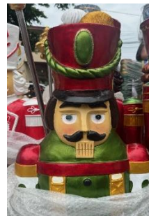
Nutcracker Soldier Statue