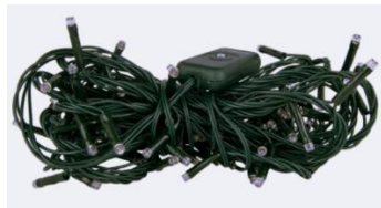
Christmas Lights, approx. 7 meters