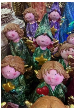
Christmas Angel Statues Set