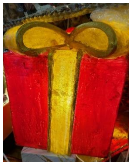
Christmas Box Décor with LED Lights