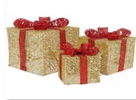
Christmas Boxes with Red Ribbons