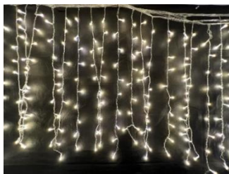
Curtain Christmas Lights