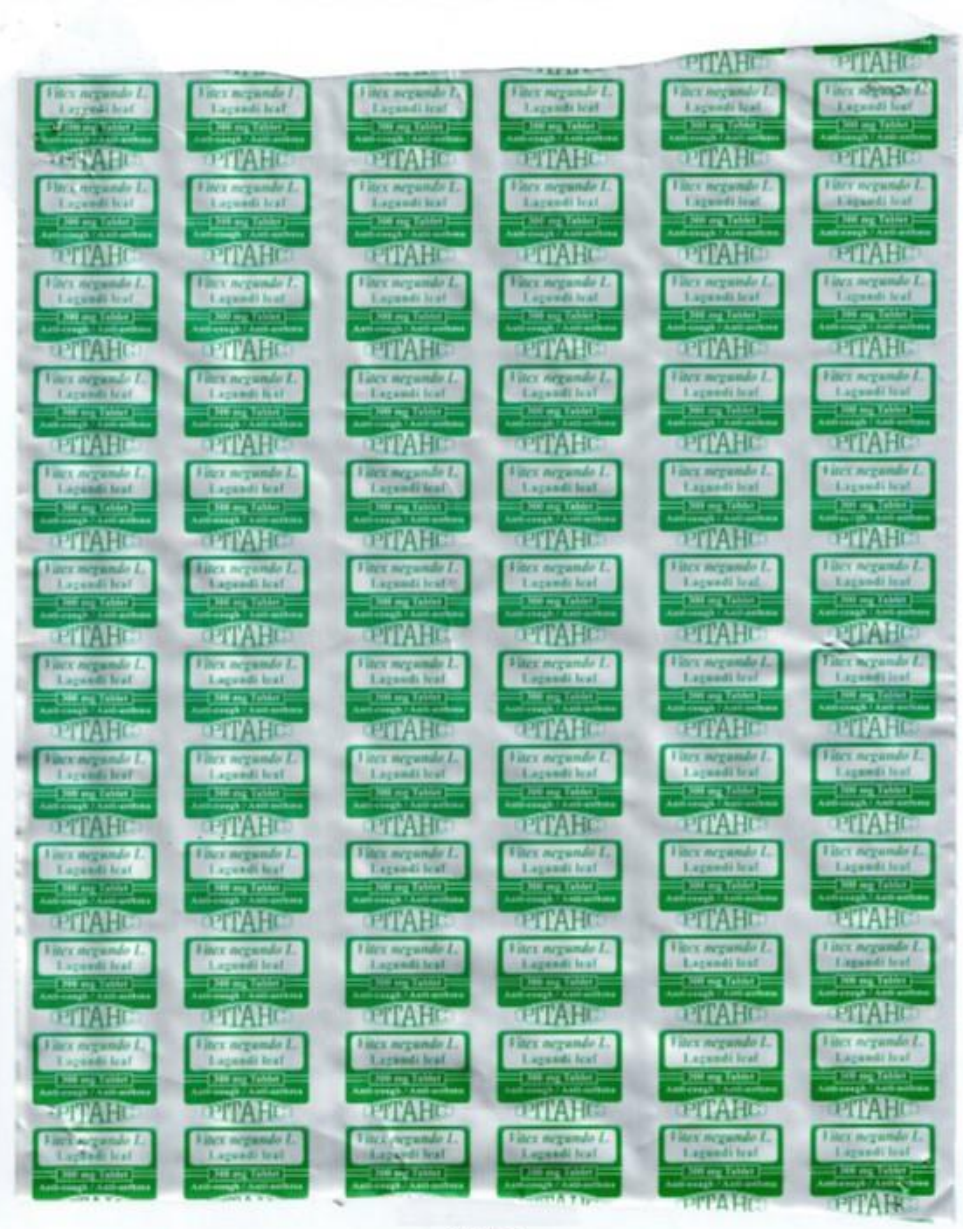
Sample – Strip Foil Lagundi