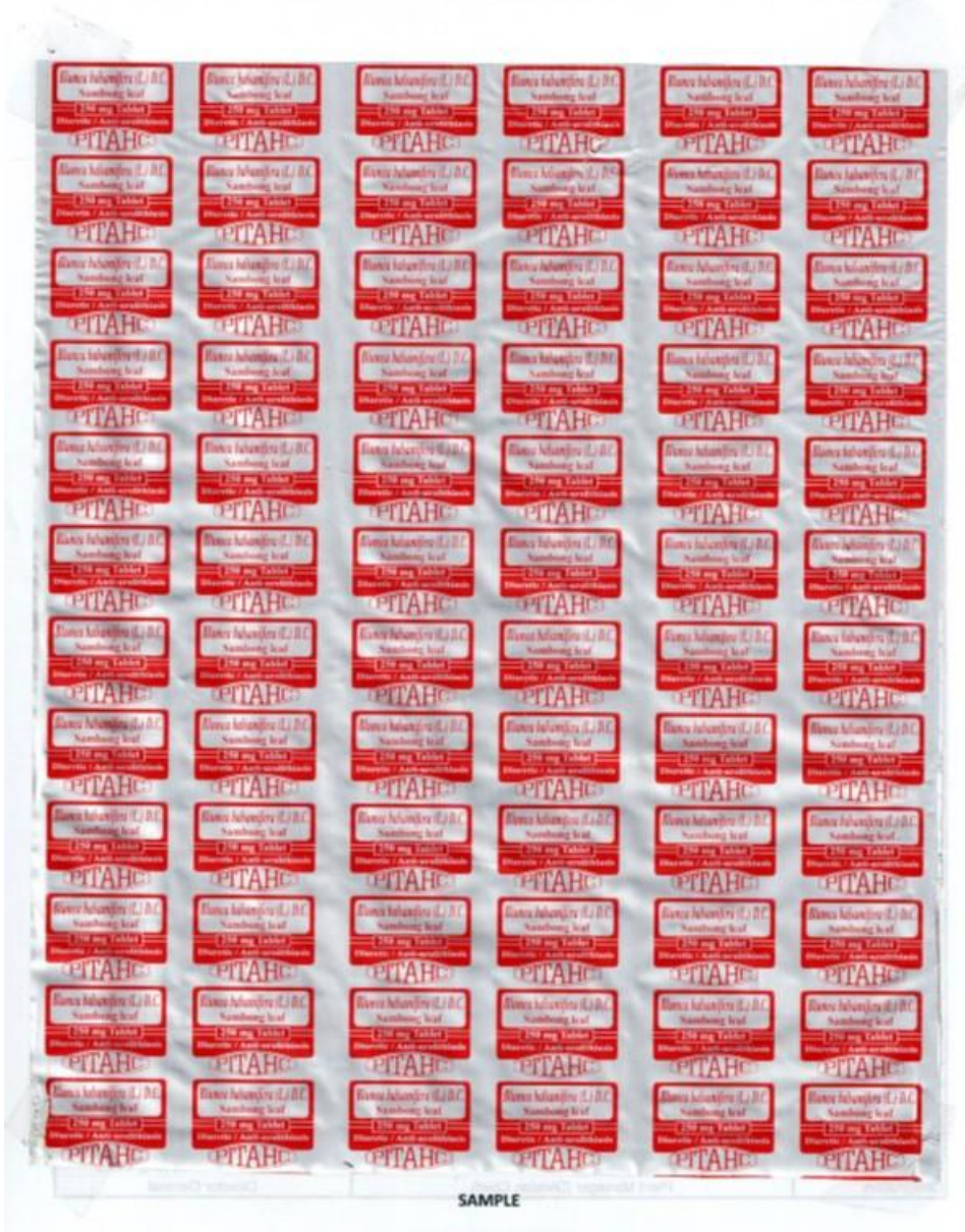
Sample - Strip Foil Sambong

Strip Foil (SAMBONG) 195mm x 90mic, ZFFE