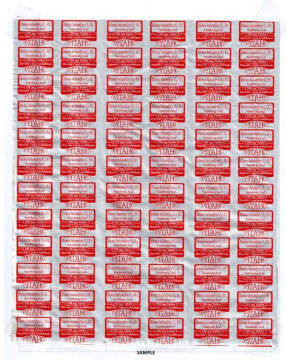
Sample – Strip Foil Sambong

Strip Foil (SAMBONG) 195mm x 90mic, ZFFE